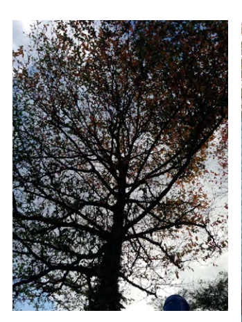
The K1 children noticing the leaves falling from the tree at the playground

The K1 children were playing in the playground when they noticed the leaves falling from the tree after a long dry spell. They noticed the different types of leaves that had fallen (the colour, the texture: some were softer than others) and the movement of the leaves as they fell. From the