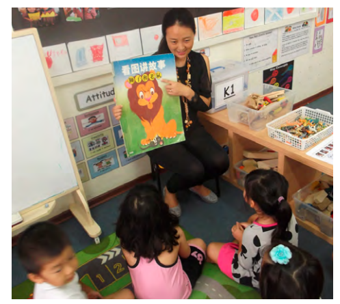
Children enjoy Mandarin time – Experiences linked to the Units of Inquiry

the majority of children that come to our school speak a language other than English. During the early years, children need maximum support in their native language. This support is particularly important since it allows children to communicate